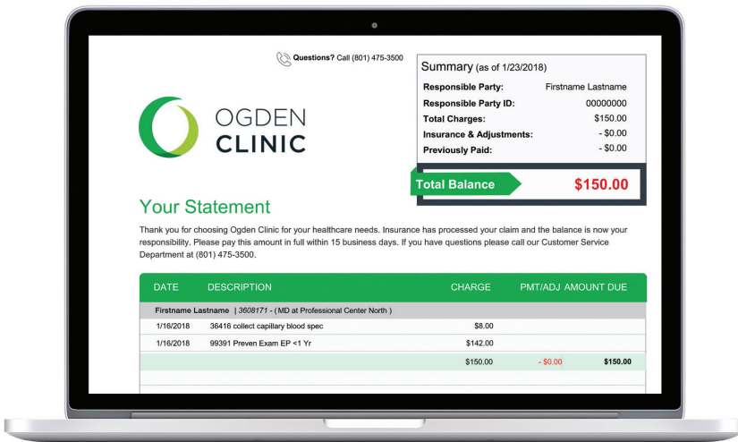
Ogden Clinic patient statements were redesigned and simplified.